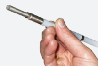
Model 408M DVP 3/8" (9.5 mm)