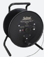
Model 102 Water Level Meter

Vapor Samples: A special Vapor Wellhead Assembly can be used to obtain depth discrete vapor samples.