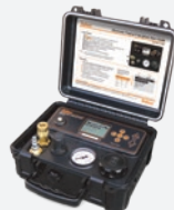
Model 464 Electronic Control Unit